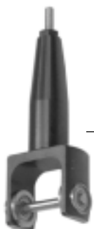
CNQSC04 Optional machined ball bearing elevator arm w/ adjustable ball link.

From parts bag 2: Insert the long threaded axle and one M3x7 ball bearing from each end of the bellcrank. Slide one short spacer over one 3x30mm Socket Cap screw and attach to the threaded axle ( do not use threadlock here! ), repeat for other side. The 2x16mm pin is assembled, just insure the elevator radius link moves freely against the Bellcrank. Thread one short steel ball into the elevator arm.